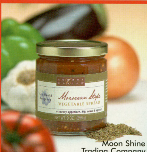
Moon Shine Trading Company