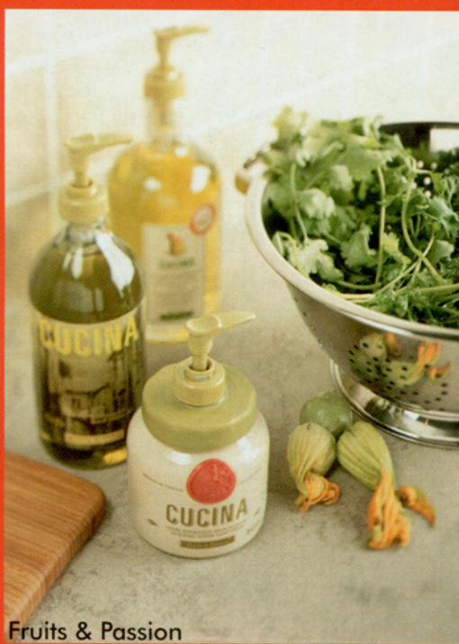
Fruits & Passion