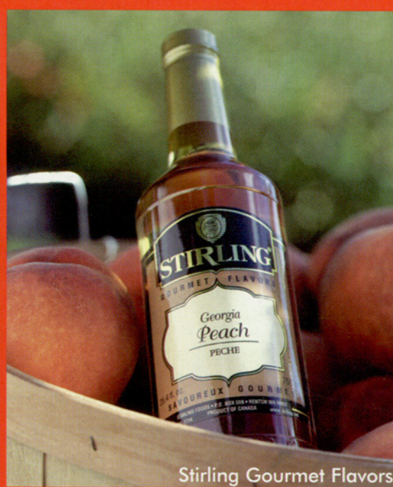
Stirling Gourmet Flavors