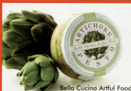
Bella Cucina Artful Food