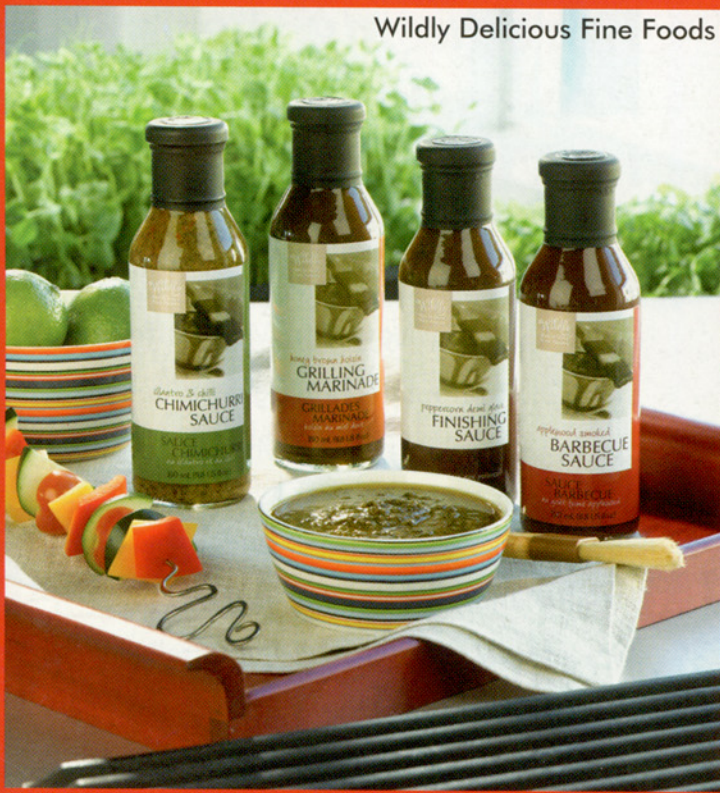
Wildly Delicious Fine Foods

THE GOURMET PRODUCTS MAGAZINE FOR RETAILERS